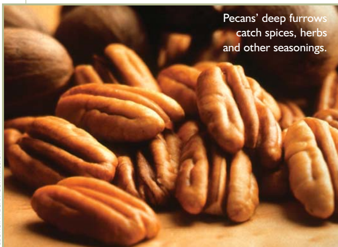
Pecans' deep furrows catch spices, herbs and other seasonings.

the daily requirement of vitamin E, a powerful antioxidant.